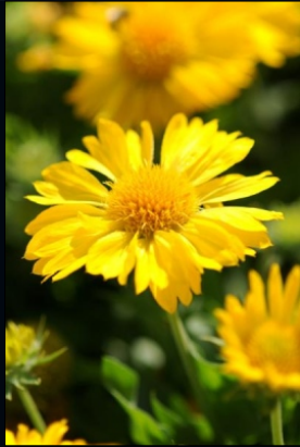
Gaillardia 'Mesa Yellow'