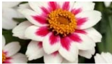
2010 All-America Selection winners